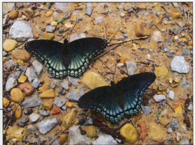
Limenitis arthemis , Oakmulgee Wildlife Management Area, Bibb County, Alabama (May 18, 2013)