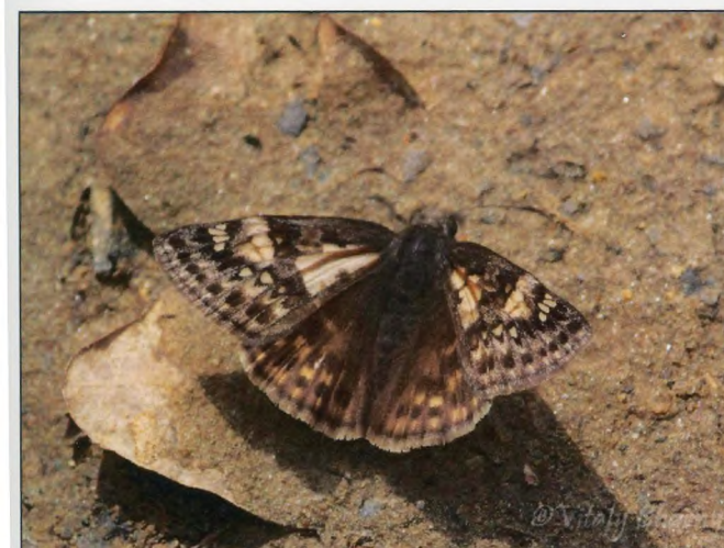
Erynnis juvenalis , Oakmulgee Wildlife Management Area, Bibb County, Alabama (March 30, 2013)