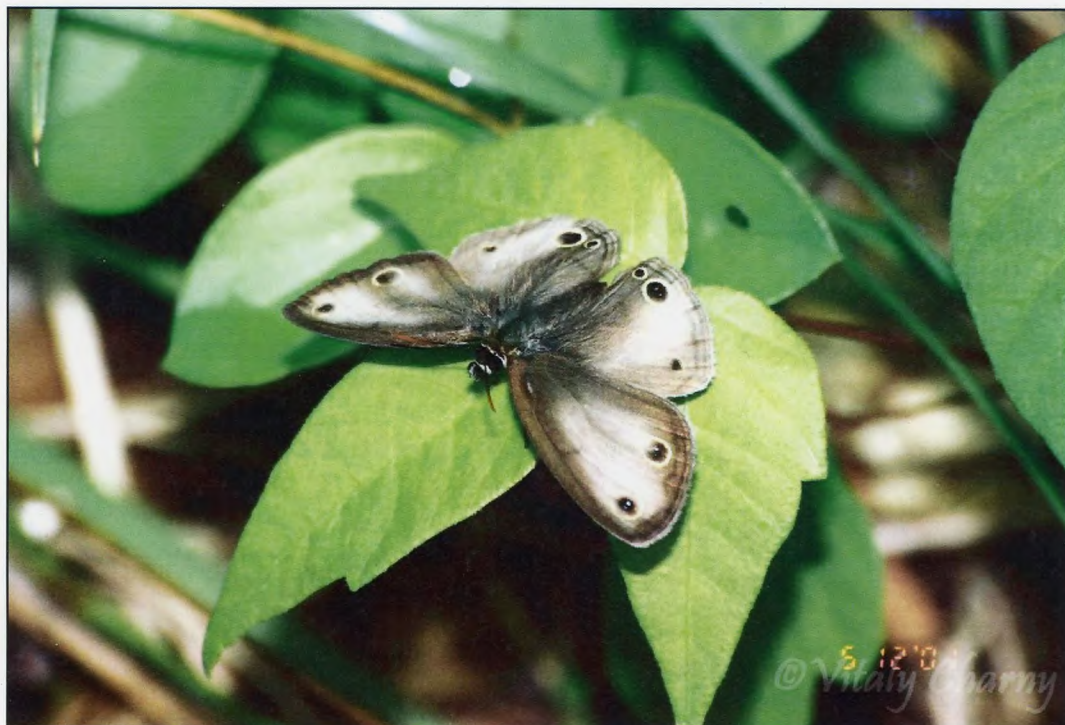
Magisto cymela , Paint Rock River East, Jackson County, Alabama (May 12, 2001)