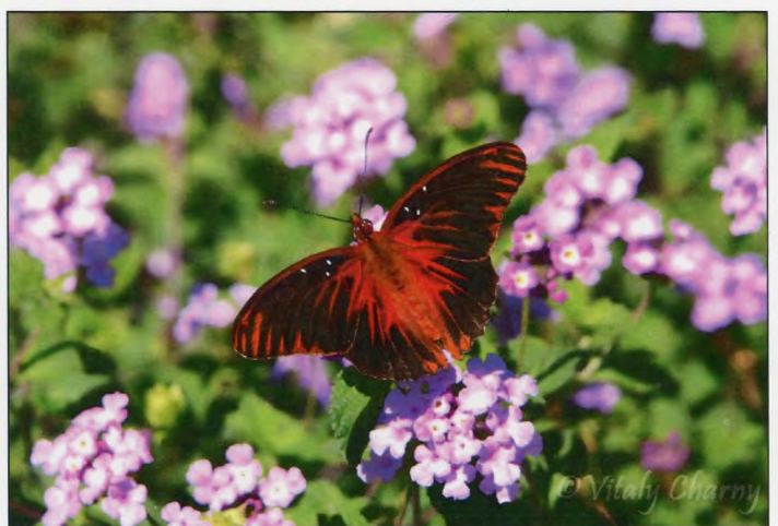
Agraulis vanillae , Huntsville Botanical Garden, Madison County, Alabama (October 21, 2007)