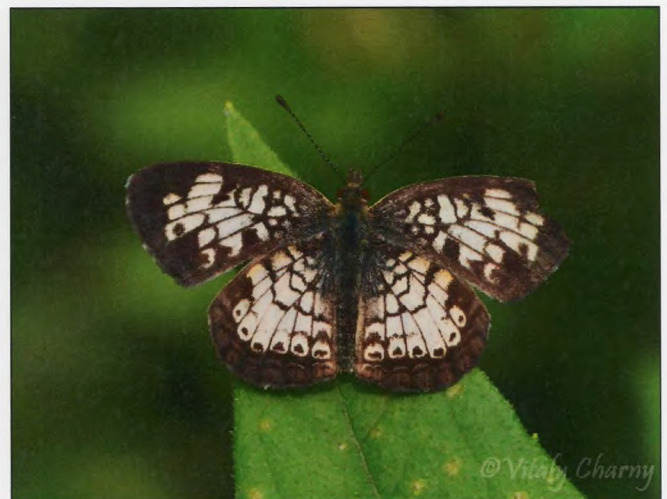
Phyciodes tharos , Cane Creek Canyon Nature Preserve, Colbert County, Alabama (May 27, 2012)