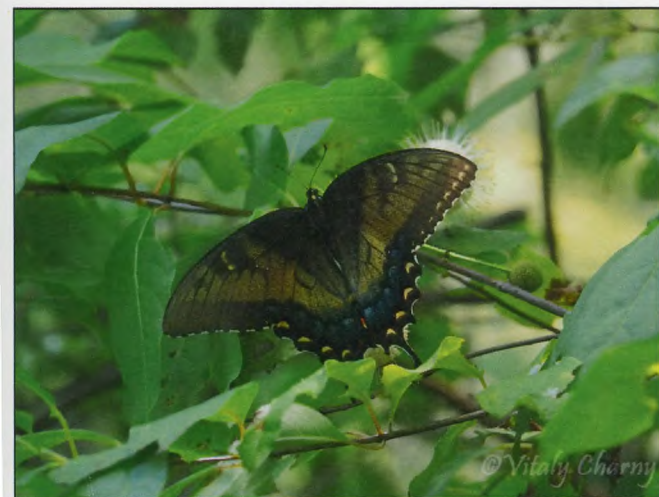
Papilio glaucus , Perry Lakes Park, Perry County, Alabama (August 23, 2015)