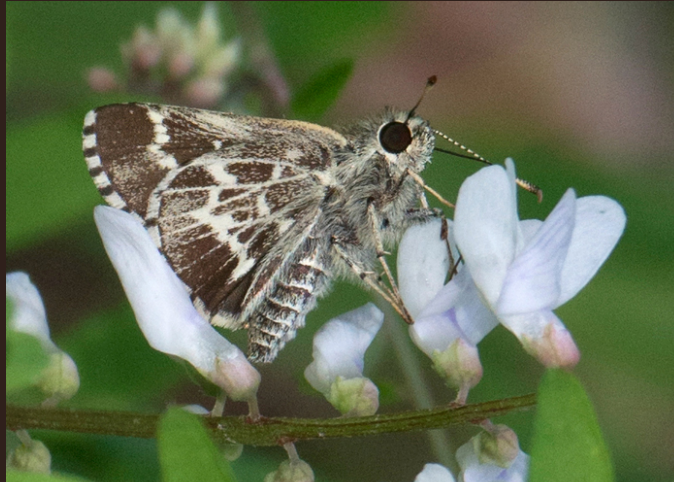
Lace-winged Roadside Skipper