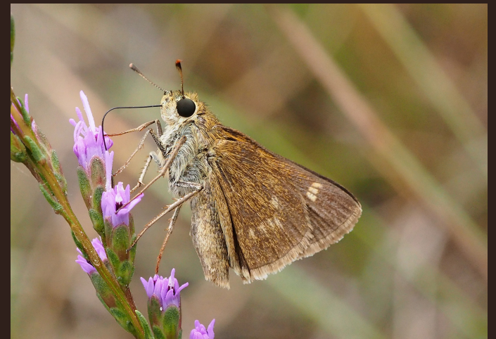
Crossline Skipper ventral