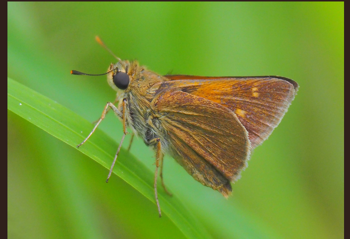
Tawny-edged Skipper ventral