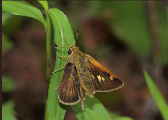
Crossline Skipper dorsal female