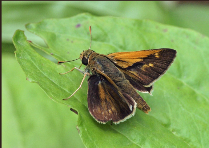
Crossline Skipper dorsal male