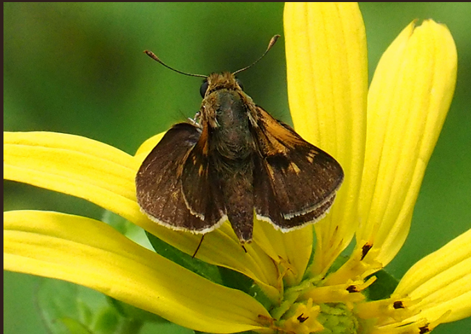
Tawny-edged Skipper male