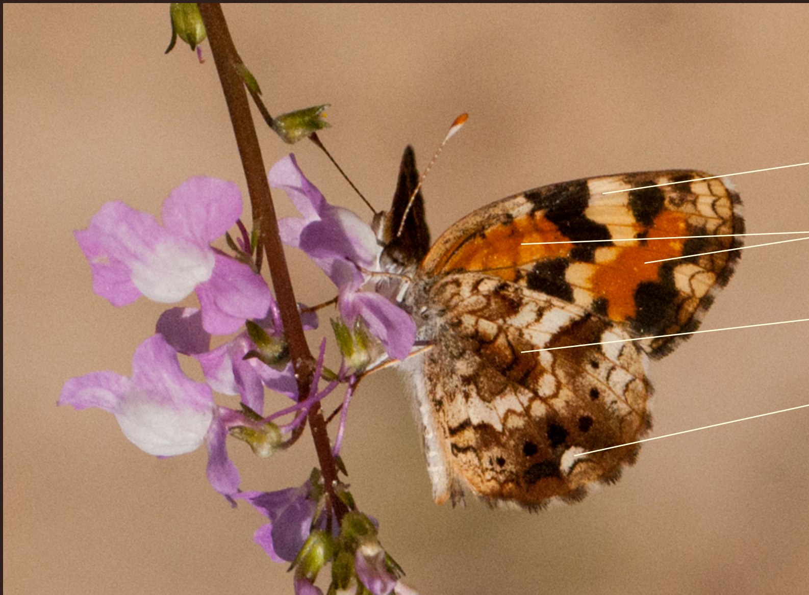
Phaon Crescent ( Phyciodes phaon )